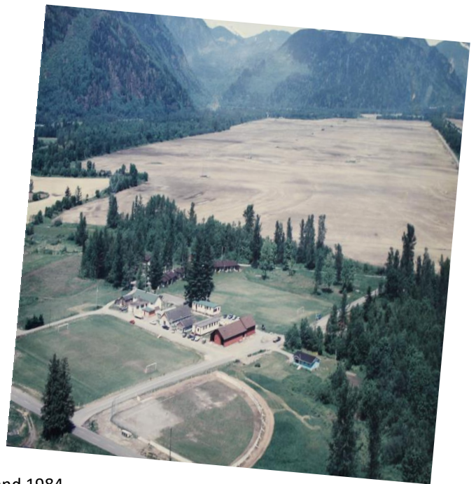
Seabird Island 1984

Seabird Island members will vote on this agreement by participating in a formal legal voting process to decide on Education Jurisdiction Ratification.