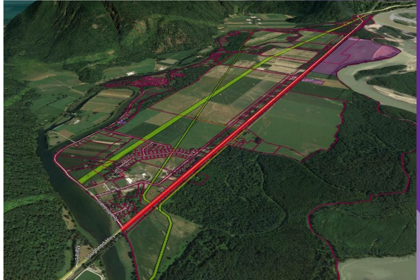
View looking north over Seabird Island (Approximate location of Lot 259 in red)

Lot 259, Plan 85386 CLSR encompasses a total of \pm 19.35 acres defined within a linear property measuring \pm 50.00 feet (12.34 meters) in width by \pm 16,857 feet (5,138 meters, or 5.1 kilometers) in length. The lot extends south from No. 6 Road in the north to Seabird Island Road and Maria Slough at the entrance to Seabird Island