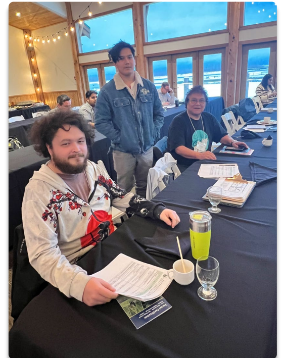
The crew at the 2024 Regional Forestry Engagement Conference

We have applied for the Disaster Risk Reduction-Climate Adaptation funding to take on a heat mapping project. The project will span from Bear Mountain to Ruby Creek, and the results will help us identify hotspots in the area that trap the most heat. Once identified, we can employ measures to reduce the amount of heat that gets trapped in the area.